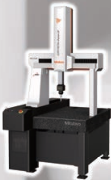
CRYSTA-Apex V 574