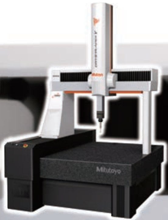
CRYSTA-Apex V 9106