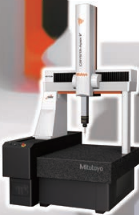
CRYSTA-Apex V 776